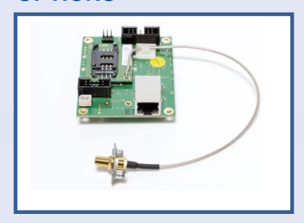
Web server - Web server + GSM